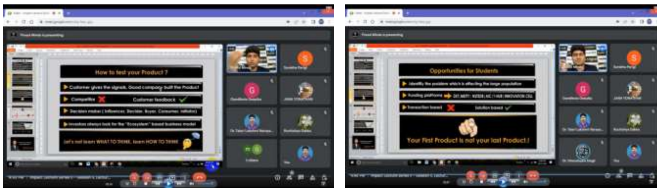
Mr. Shaik Fayaz Ahammed delivering the lecture in google meet virtual mode

The participants attained the program outcomes such as definition of prototype and virtual prototype, prototyping cycles, six stages of prototyping, categories and types known the current employability in the world with statistics, differences between business and start-ups.