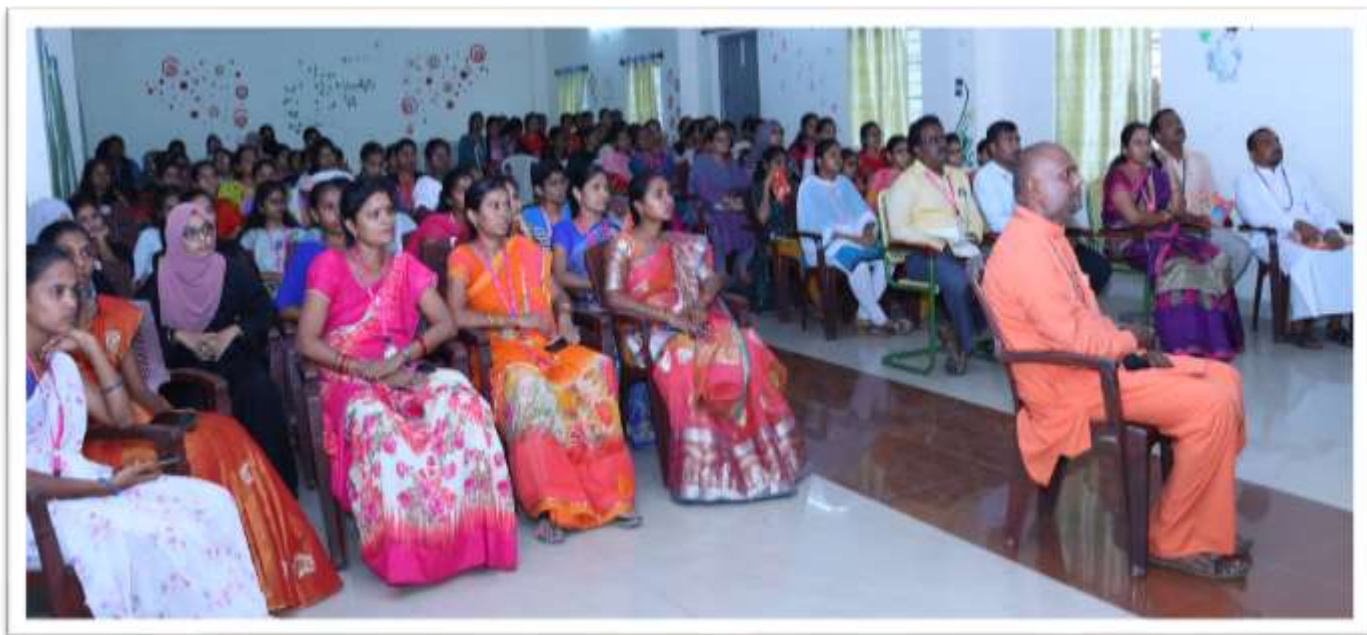
Audience listening to motivational speech of the Swamiji